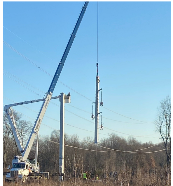
Installation of a new 115kV transmission structure on the RTS